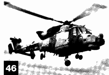
Ministry of Defence/Crown Copyright 1438277