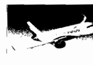
31 Indian LCC IndiGo gives Airbus its largest single order to date, for 250 A320neos.