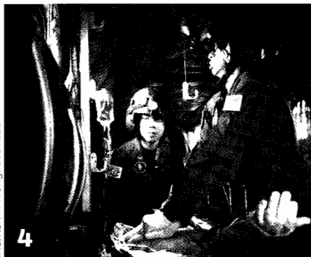
IHS/Kelvin Wong, 1639025