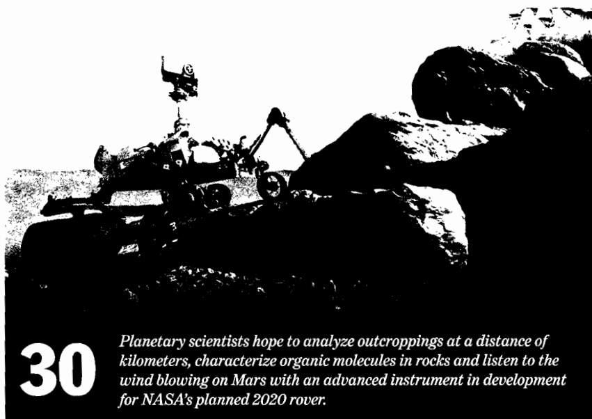
Planetary scientists hope to analyze outcroppings at a distance of kilometers, characterize organic molecules in rocks and listen to the wind blowing on Mars with an advanced instrument in development for NASA's planned 2020 rover.